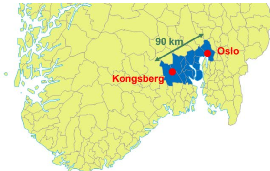
Figure 1. Map of the main study area, the Oslo-Kongsberg region.

The Oslo-Kongsberg region is defined as the Norwegian study area in COMPETT. The region is located in the southern part of Norway to the south-west of the capital Oslo, see figure.1. In COMPETT the Oslo-Kongsberg region has been defined to include the following municipalities: Oslo, Bærum, Asker, Lier, Hurum, Røyken, Nedre Eiker, Øvre Eiker, Drammen, Kongsberg, Svelvik, Sande, Hof and Holmestrand.