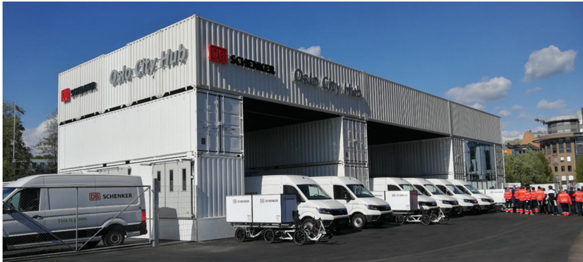
Figure S.1: Oslo City Hub from the official opening on 8 May 2019.

Oslo City Hub consists of several containers assembled into a construction that enables a flexible and temporary solution with a low investment cost. In connection with the design phase of the Oslo City Hub, several and regular project meetings have been held to discuss sketches and solution proposals. According to both the project partners and DB Schenker, it has been crucial to bring the user of the Oslo City Hub with their expert knowledge in the design phase of the project. Figure S.1 shows the final construction of Oslo City Hub taken from the official opening on May 8, 2019.